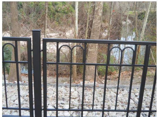
View of the fencing after the repair, panel # 5. View to the east.