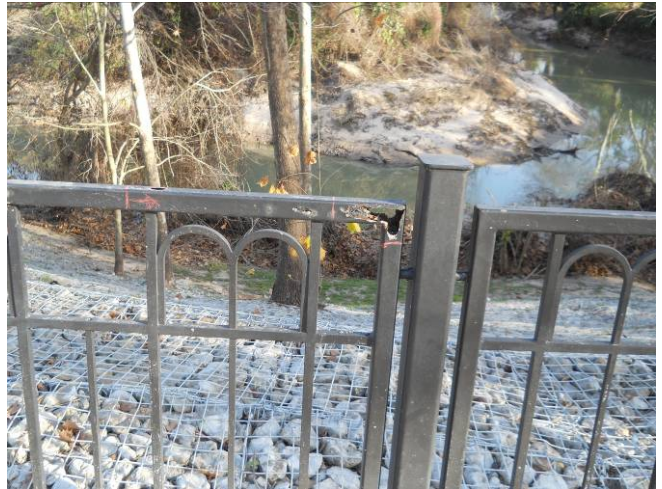
View of the old fencing before it was repaired on Farnham Park, panel # 10. View to the east.