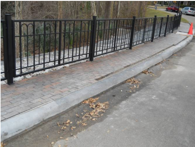
Repainted the metal fencing on FARNHAM PARK. View to the southeast.