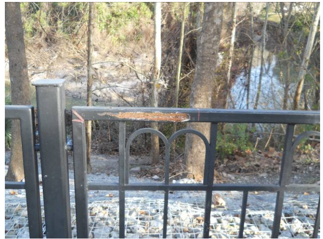
View of the metal fencing before repair, panel # 5. View to the east.