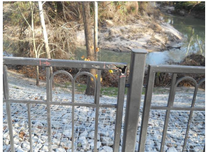
View of the old fencing before it was repaired on Farnham Park, panel # 10. View to the east.