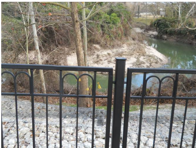
View of panel # 10 fencing after it was repaired. View to the east.