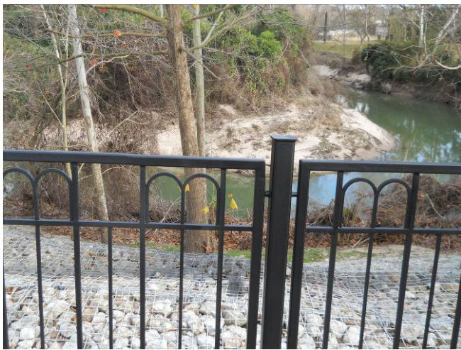
View of panel # 10 fencing after it was repaired. View to the east.