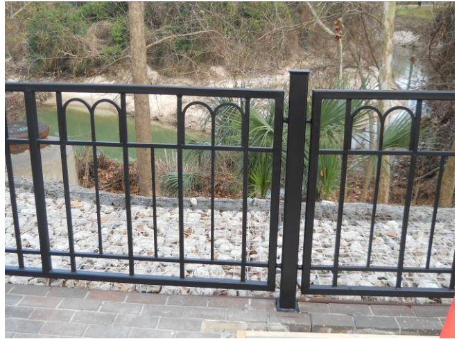
Repaired and repainted the metal fencing, panel # 1. View to the east.