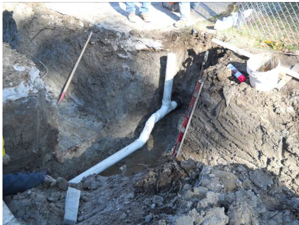
Contractor had to lower a sanitary sewer service to install the new storm sewer piping. View to the east.