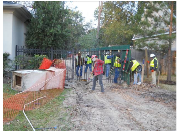
Re-installing the metal fence at 439 Piney Point View to the west.