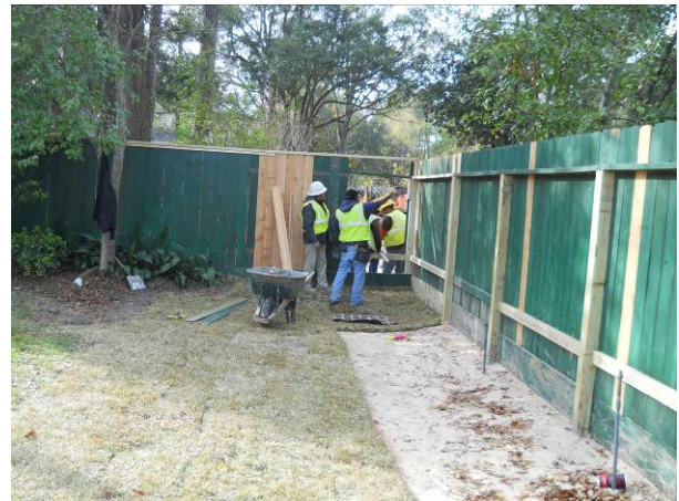
The contractor is completing installation of the wooden back fence in the easement between Piney Point Rd and Gingham. View to the east. Installed sod grass in the back yard of 439 Piney Point.