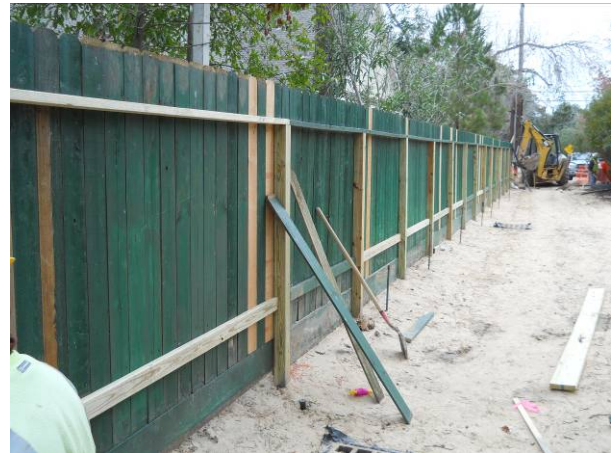
Contractor installed the wooden fence between Piney Point and Gingham at 439 Piney Point. View to the east.