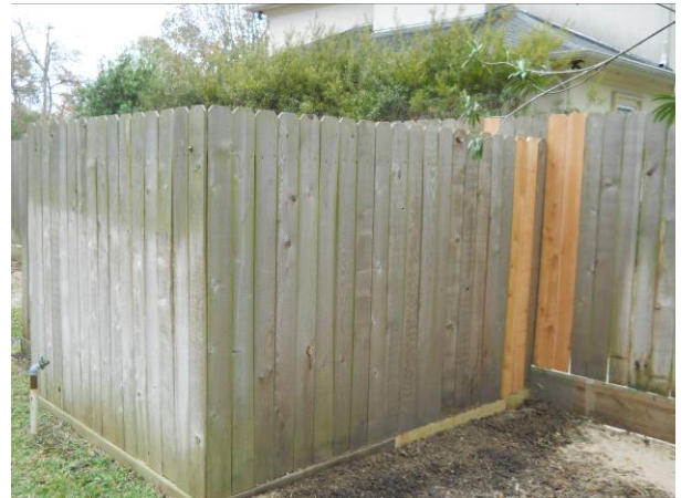
Contractor installed the wooden fence between Piney Point and Gingham at 443 Piney Point. View to the southeast.