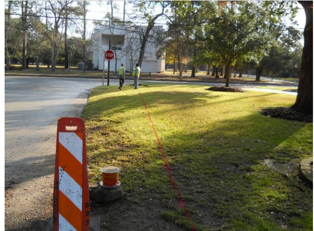
Contractor marked out the location of the new storm sewer line location on Calico Lane and Piney Point road.