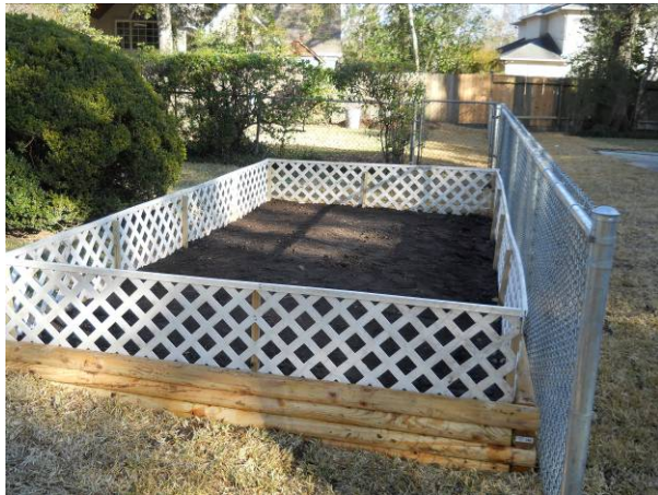
Contractor replaced the garden fencing in the easement between 426 and 430 Gingham Dr. View to the east.