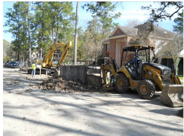
Contractor installing the new storm line on the north end of Gingham. View to the north.