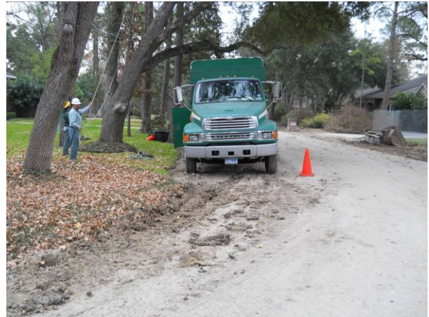
The contractor had dressed up and cut to grade the sides of Gingham when the water crew on Bending Oaks and a tree trimming truck drove over and parked on the area. View to the east.