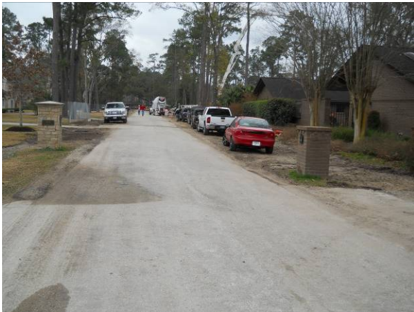
Contractor had dressed up the sides of Jan Kelly. Home contractors worker parked on the dress up area of Jan Kelly leaving ruts. View to the south