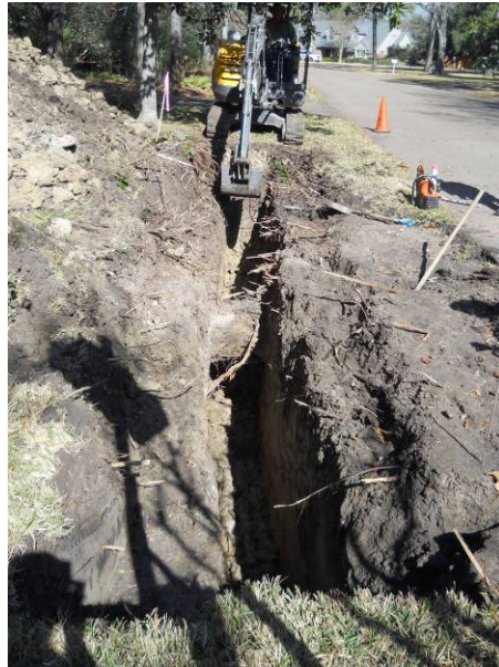
Excavating for the water line off set on Tynebridge Lane View to the north.