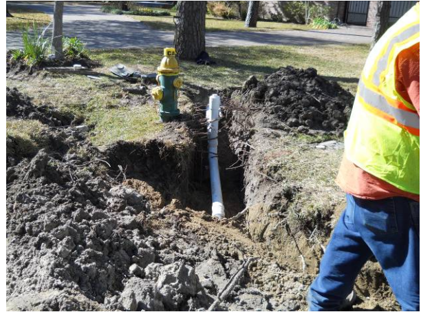
The yard drain was installed on the back side of a fire hydrant because of the FH valve. View to the southwest.