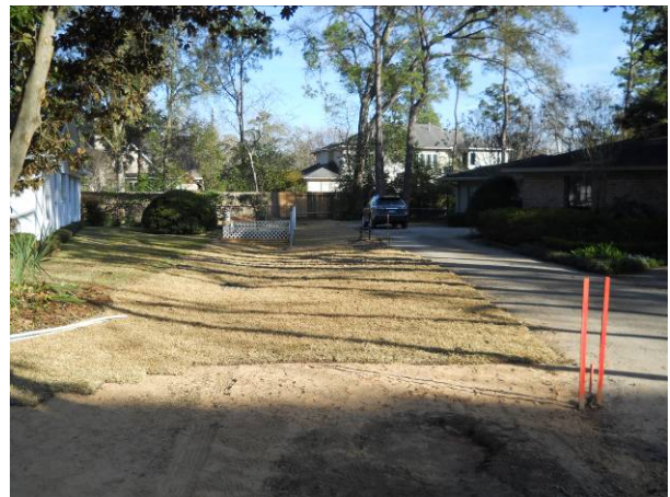
The contractor placed more sod grass in the easement between 426 and 430 Gingham Dr. View to the east.