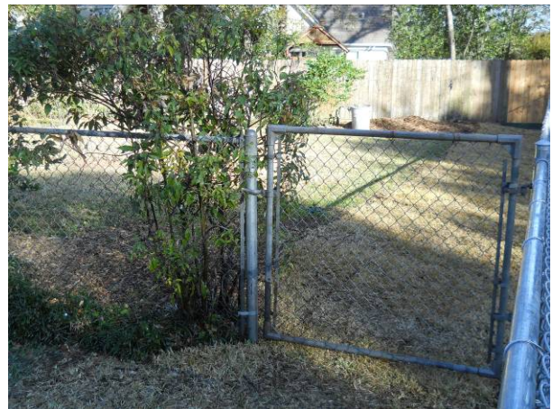
Contractor placed the sod grass and repaired the gate at 430 Gingham Dr, View to the east.