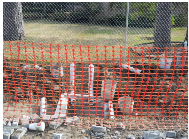
Install yard drains into inlet on the east side of Jan Kelly. View to the east.