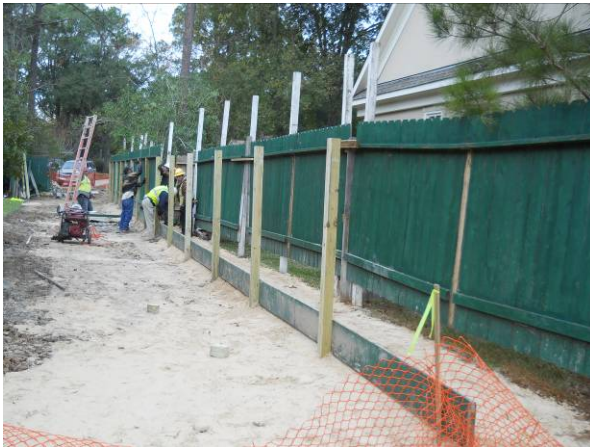
Set the new post in the easement between Piney Point Rd and Gingham. View to the Northwest.