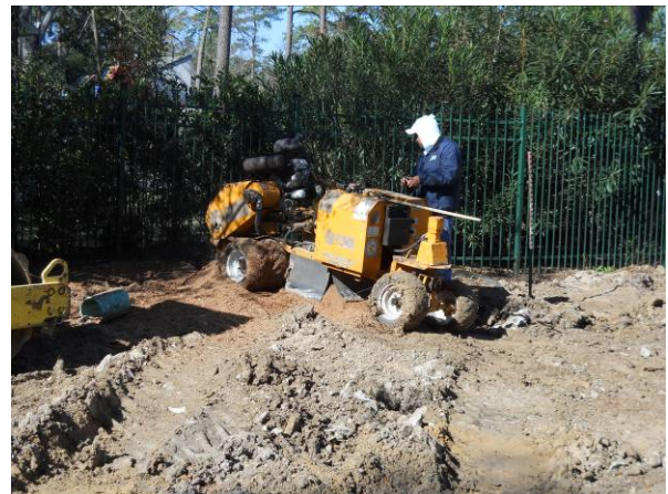
Performing stump grinding on Jan Kelly. View to the west.