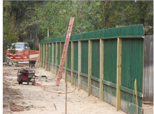
Moved the existing wooden fence over to the new post in the easement between Piney Point Rd and Gingham. View to the west.