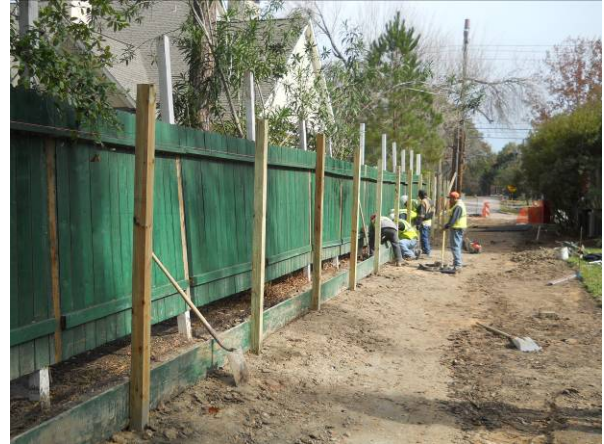
Set the new post in the easement between Piney Point Rd and Gingham. View to the east.